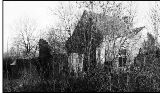
View on corner of Chapel from the road