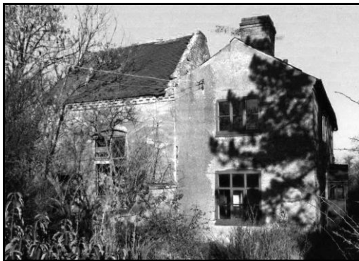
View from Gelsmoor Rd. with The remains of Chapel on the left