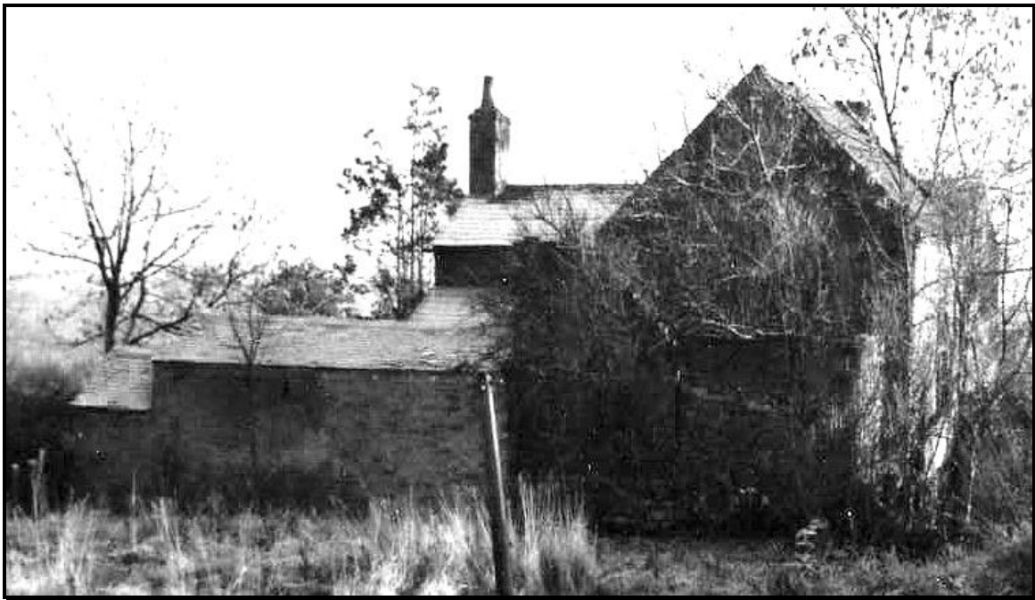
THE OLD REMAINS OF THE CHAPEL, SCHOOLROOM AND MANSE c.1980.

BY SAMUEL T STEWART - UPDATED MARCH 2026