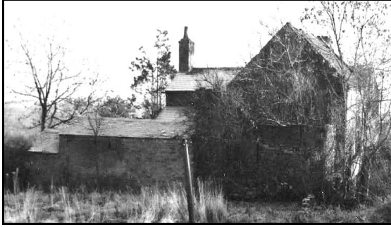
View from Chapel and Sunday School side