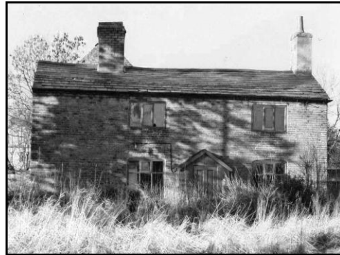
View from Manse side