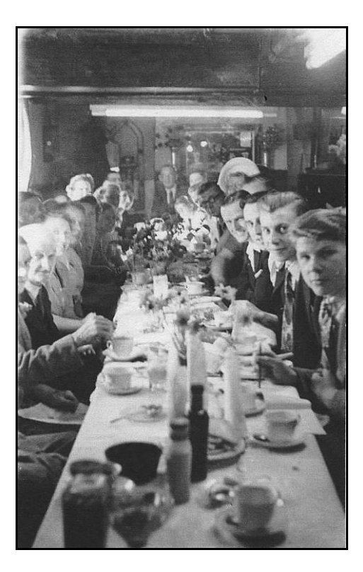
End of season dinner at "The Angel Inn" - June 3rd 1950