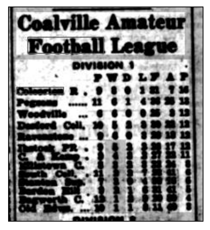
Leicester Evening Mail - Saturday 21 April 1956