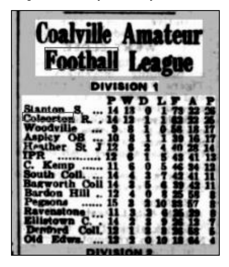
Leicester Evening Mail - Saturday 05 January 1957

Leicester Evening Mail - Saturday 04 January 1958