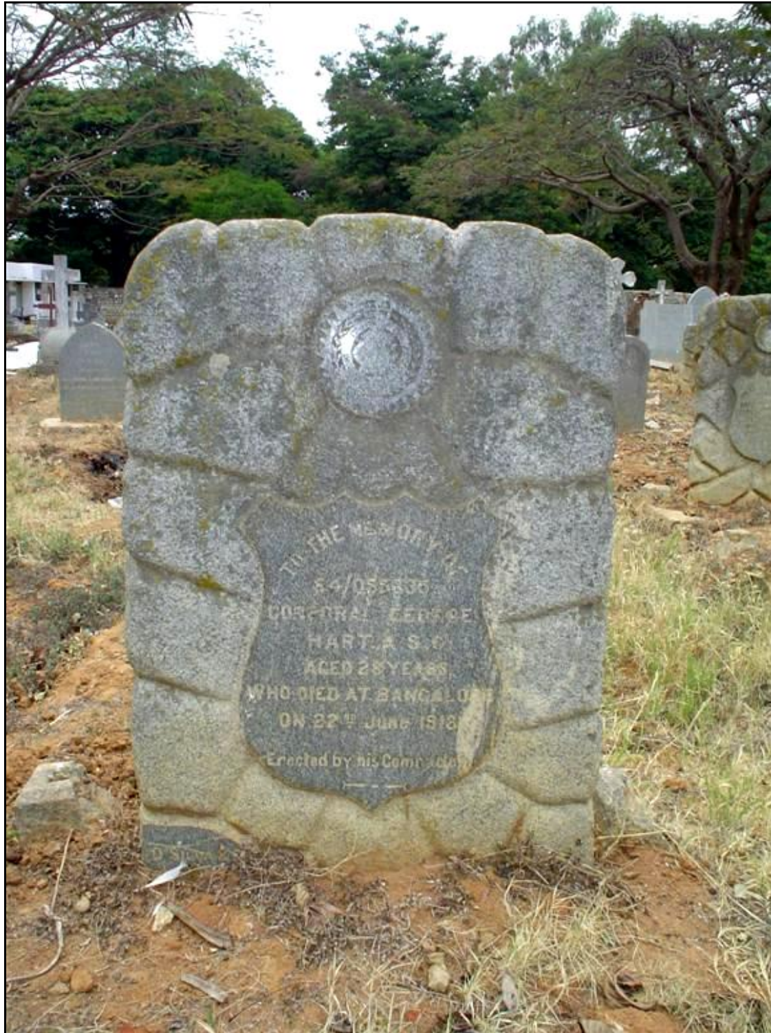
THIS IS THE GRAVESTONE FOR CORPORAL GEORGE HART IN THE NEW PROTESTANT CEMETERY No 2. (HOSUR ROAD) BANGALORE ERECTED BY HIS COMRADES, HAVING DIED FROM SMALL POX DURING ACTIVE SERVICE