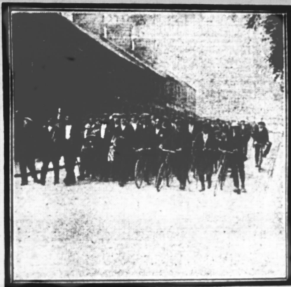
A contingent of miners from Pegg's Green, Coleorton and Griffydarn district who went on a peaceful mission to Ashby to stop outcropping. Some of the men carried Union Jacks—not Red Flags—and sang popular songs en route.