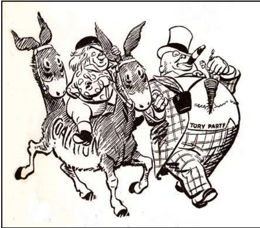
David Low (cartoonist b. 7 th April 1891) on the David Lloyd George Coalition (1918)

Two weeks after the end of the first World War, the prime minister, David Lloyd George gave a speech in Wolverhampton: "The work is not over yet – the work of the nation, the work of the people, the work of those who have sacrificed. Let us work together first. What is our task? To make Britain a fit country for heroes to live in. I am not using the word 'heroes' in any spirit of boastfulness, but in the spirit of humble recognition of fact. I cannot think what these men have gone through. I have been there at the door of the furnace and witnessed it, but that is not being in it, and I saw them march into the furnace. There are millions of men who will come back. Let us make this a land fit for such men to live in. There is no time to lose. I want us to take advantage of this new spirit. Don't let us waste this victory merely in ringing joy bells."