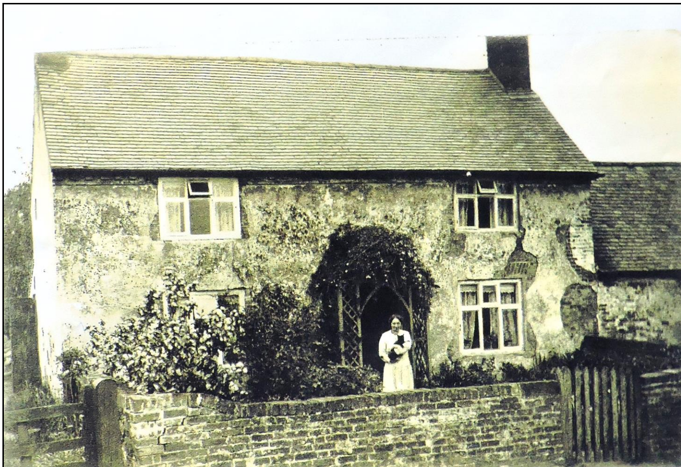
Meadow View Cottage – c. 1920

Meadow View was situated on Pol Matchet's Lane, now named Dawson's Road. It is still there on the sharp bend after the Council Houses with a large well tended vegetable garden. The lady in the photograph according to local information is Lillian Allard who was born on the November 17 th 1885.