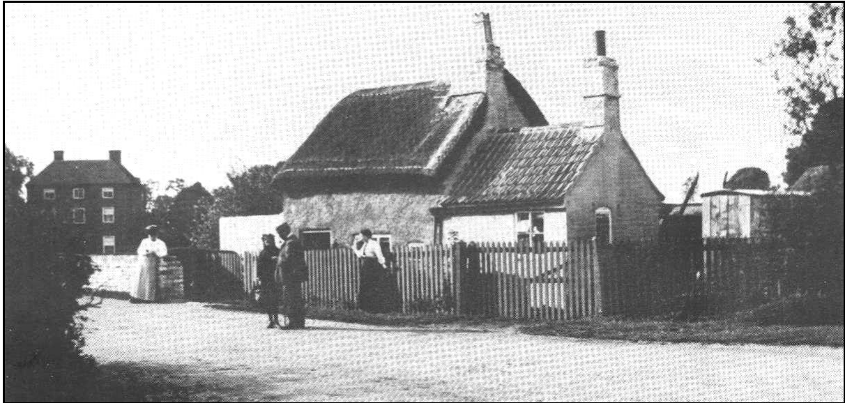
Early 20 th century photograph of single storey thatched cottage

It has been pointed out that the walls of the original part of this cottage were made from "Wattle and Daub" and possibly dates the original core of this property back to the 16th century.