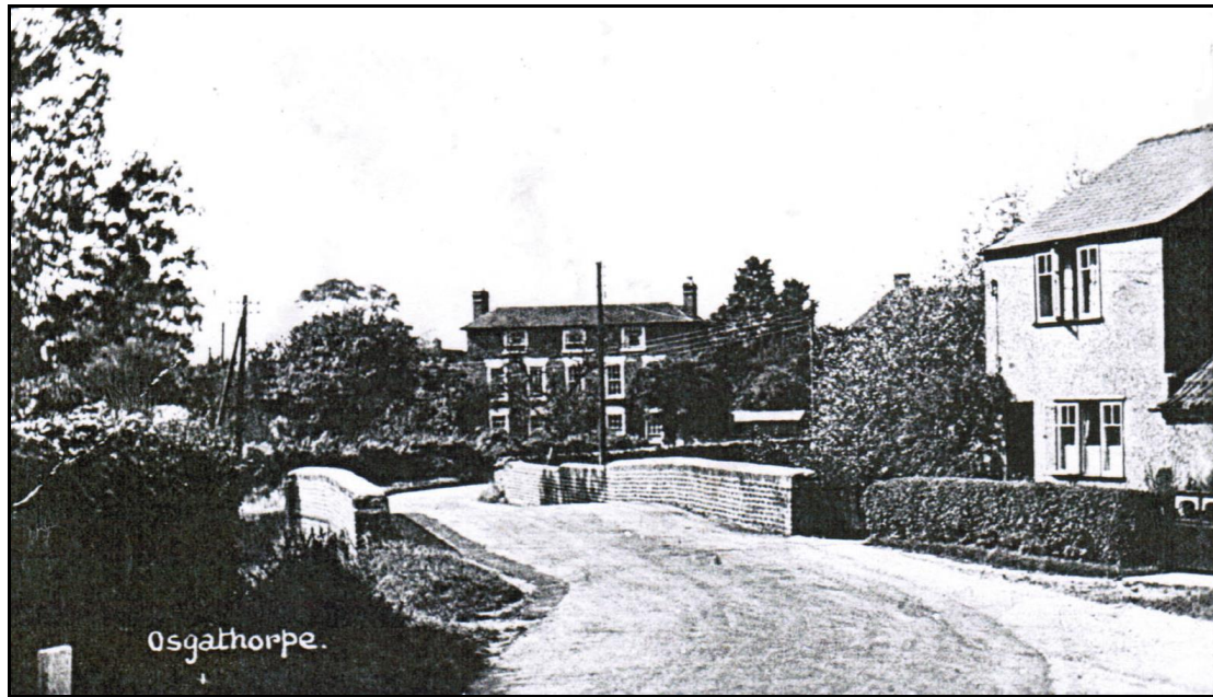
Photograph after the thatched cottage was replaced by a two storey brick building with a tiled roof. See photograph below taken from the other side of the bridge.