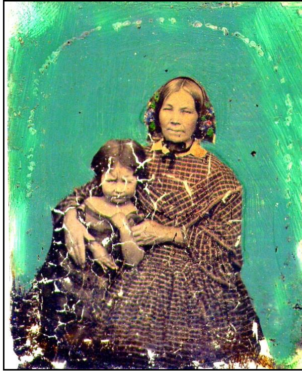
Original Photograph - Colour hand tinted on glass