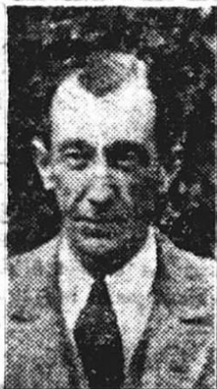
SIR GEO. BEAUMONT

A PAINTING of a man's head, stated by an expert to be by Rubens and worth £10,000, has been found among a collection of faded canvasses at