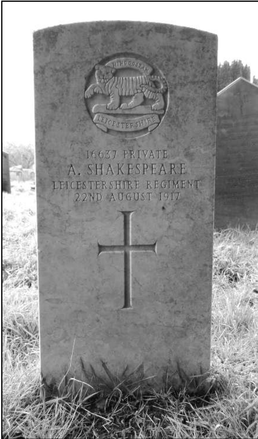
Commonwealth War Grave Commission grave made from Portland Stone in Griffydam Wesleyan Methodist Graveyard It includes the Leicestershire regimental symbol