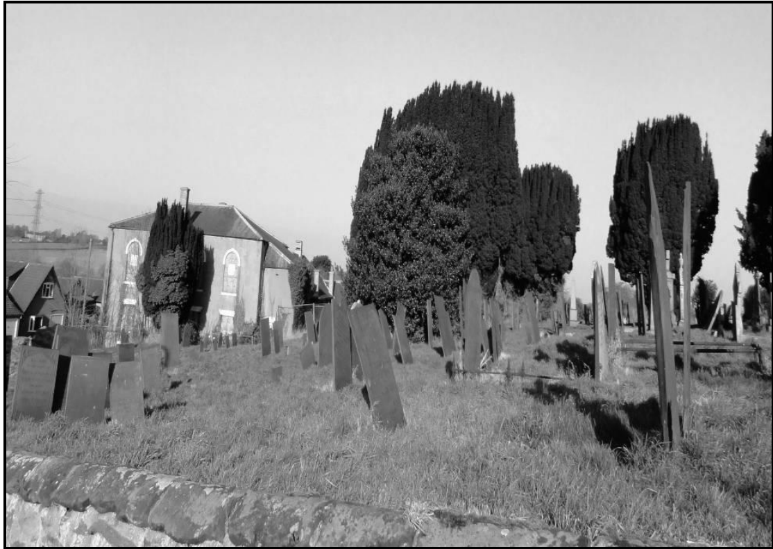
Griffydham Wesleyan Methodist Chapel and the old part of the graveyard viewed from "The Tents"