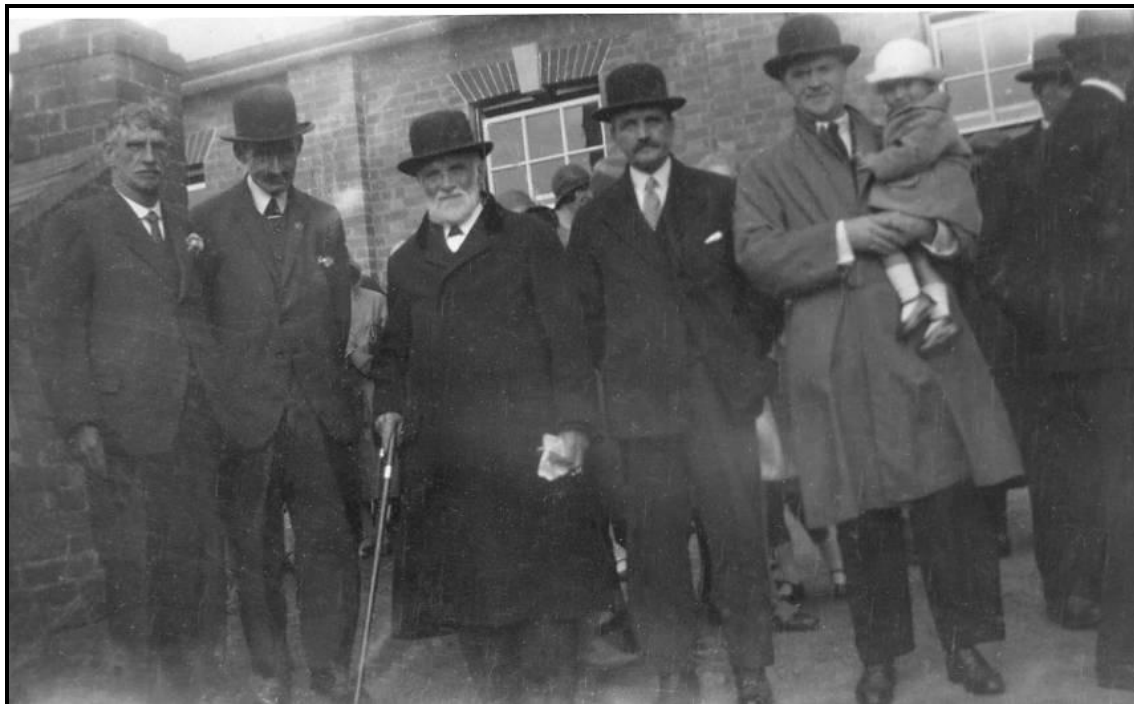
Photograph taken at the opening of the new Sunday School building in 1932 on the LH side of the Chapel.

This was built by Ramsdens' of Castle Donnington