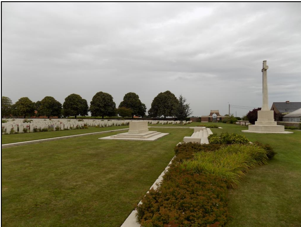
16638 PRIVATE ALFRED CLIFFORD COMMEMORATED ON MEMORIAL TABLET AT POELCAPELLE BRITISH CEMETERY, Langemark-Poelkapelle, Arrondissement Ieper, West Flanders (West-Vlaanderen), Belgium. Location - St. Jean Churchyard. Mem. 13.