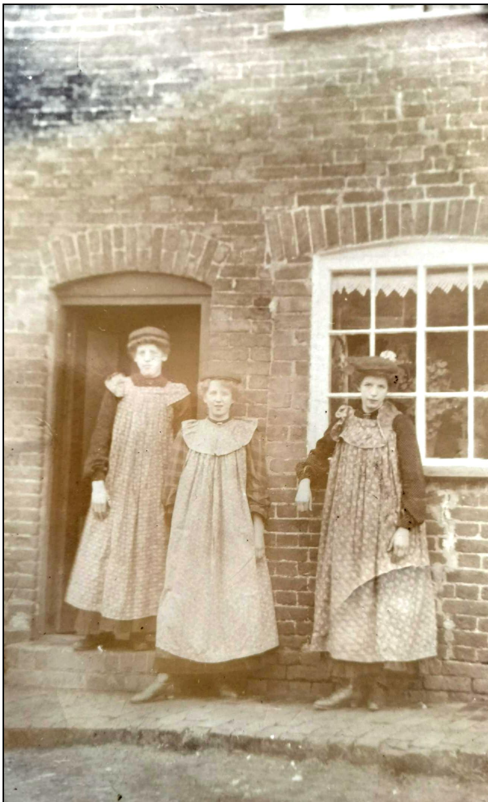
Three of the Platts daughters outside the cottage in Main Street