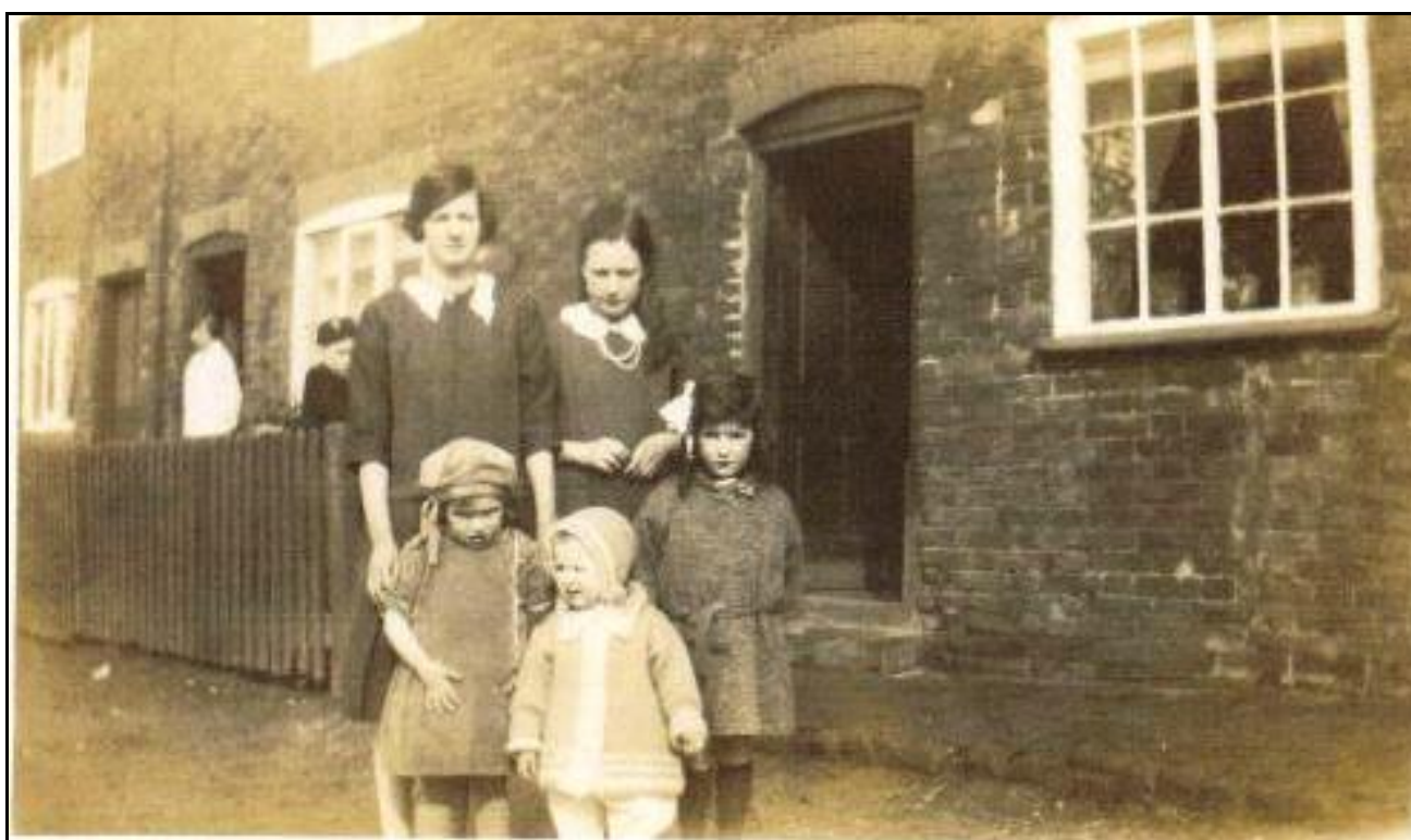
This Photograph shows the cottage as it was c.1920. The Two older girls in the Photograph are the 2nd and 3rd daughters of Thomas and Emma's son Joseph together with three of their Platt cousins