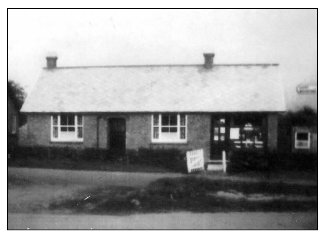
STEWARTS SHOP AT NEWBOLD