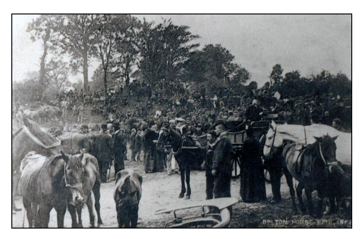
BELTON HORSE FAIR - 1896?