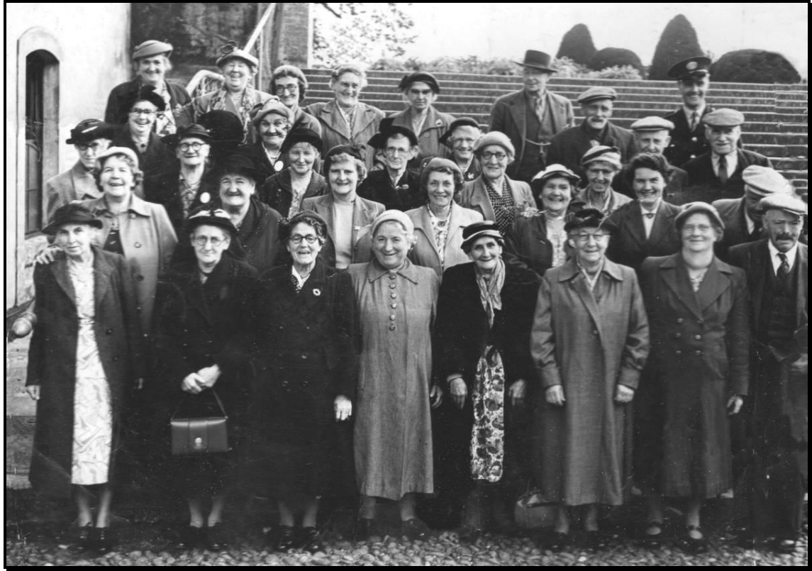
THOUGHT TO BE THE FIRST OUTING IN 1954