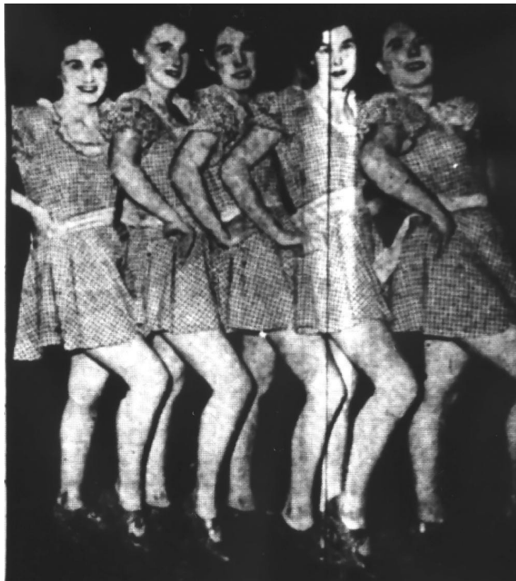
Some of the members of the dancing team