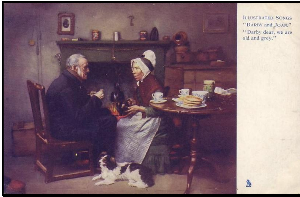
From an old postcard