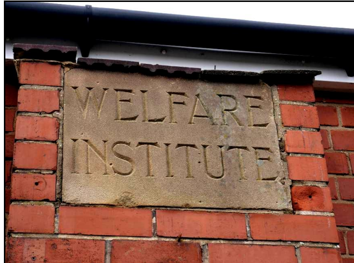
The Original Sandstone Plaque