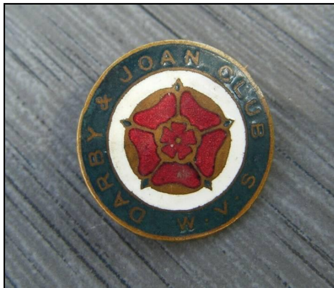
Darby & Joan Club "Women's (Royal) Voluntary Service" emblem