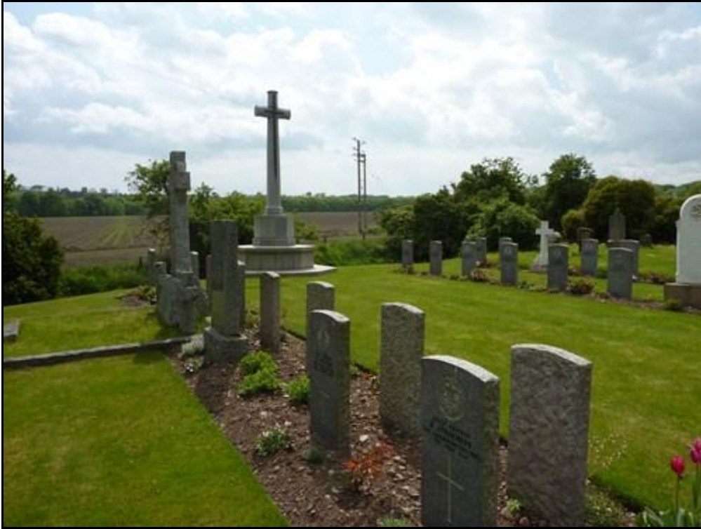
The graves of the bodies that were recovered in Cromarty Cemetery which overlooks the site of the tragedy.

The body of 8389S Stoker Archibald Robert Caskie was not recovered and his death is commemorated on the Chatham Naval Memorial - Panel 14 Column 2 (see photograph on page 2)