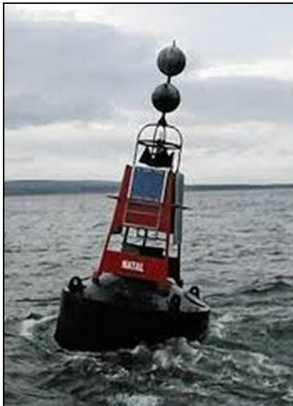
Below: The Buoy marking the site of the wreck today.