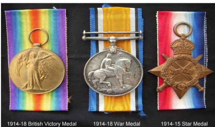
1914-18 British Victory Medal