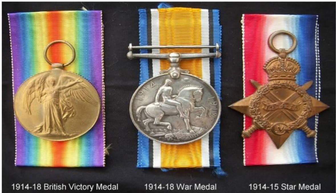
1914-18 British Victory Medal