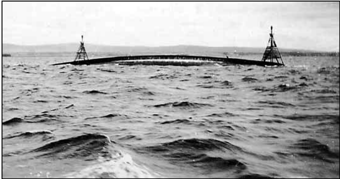
Above: The upturned hull of Natal in Cromarty Firth