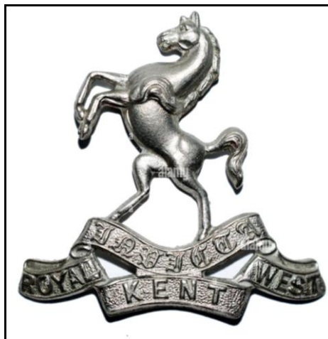
Cap badge of the Queen's Own Royal West Kent Regiment worn by Archie in the photograph on the previous page.

As Archibald was killed on the 24th of August 1942, one can only assume that it was during the above fighting that was taking place in the area when it happened.