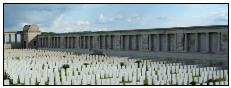
14681 PRIVATE SIDNEY JOHNSON IS COMMEMORATED ON SIDE PANEL 30B