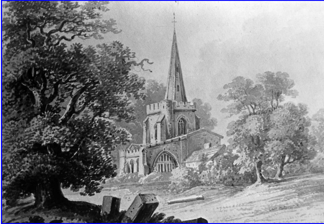
A pen and grey wash drawing of St. Mary's Church by H.W. Burgess. Dated c.1852

In 1851/2, two new windows were put in the west side of the church for the first anniversary of the 9 th Baronet's wedding and the baptism of his son and heir. This appears to have been the start of the complete restoration of the church, when the north aisle was also extended.