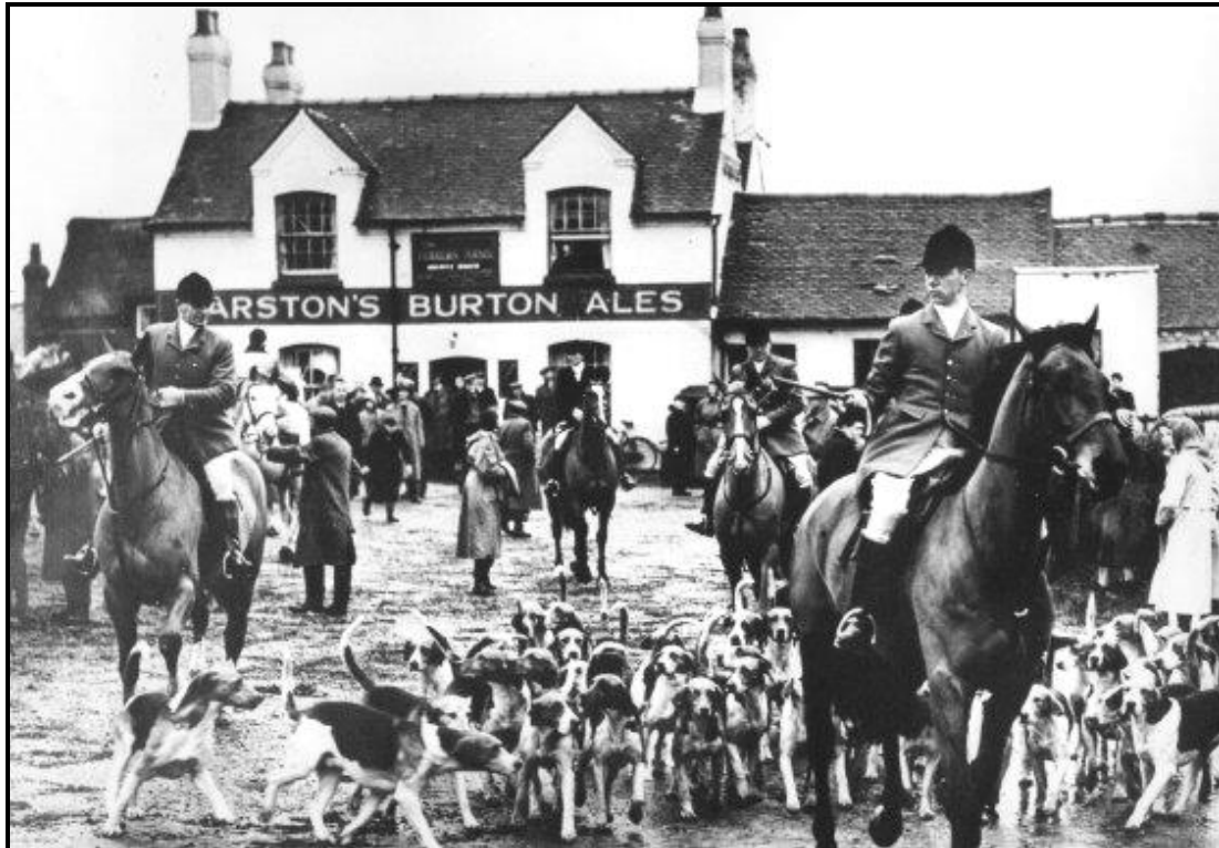
The Quorn Hunt at the Ferrers Arms c.1950