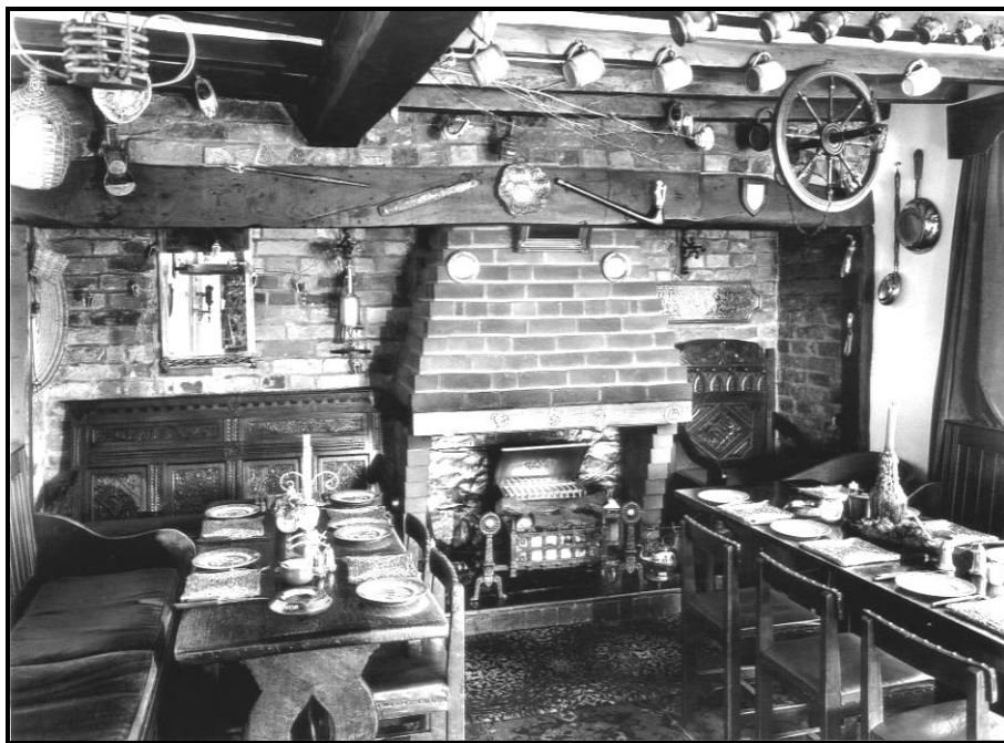
Interior of Ferrer's Arms 1969