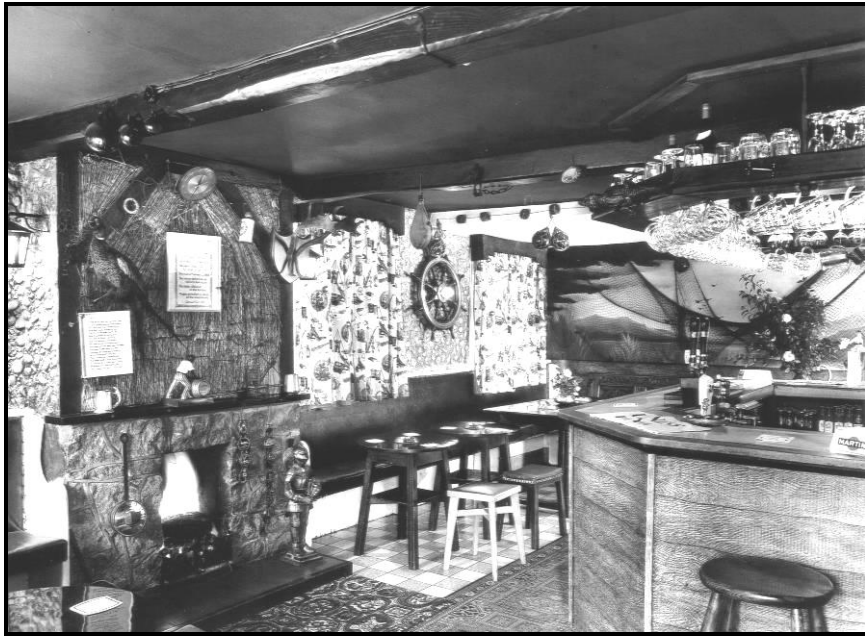
Interior of Ferrer's Arms 1969